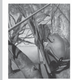
Lauren Mulhern Watercolors